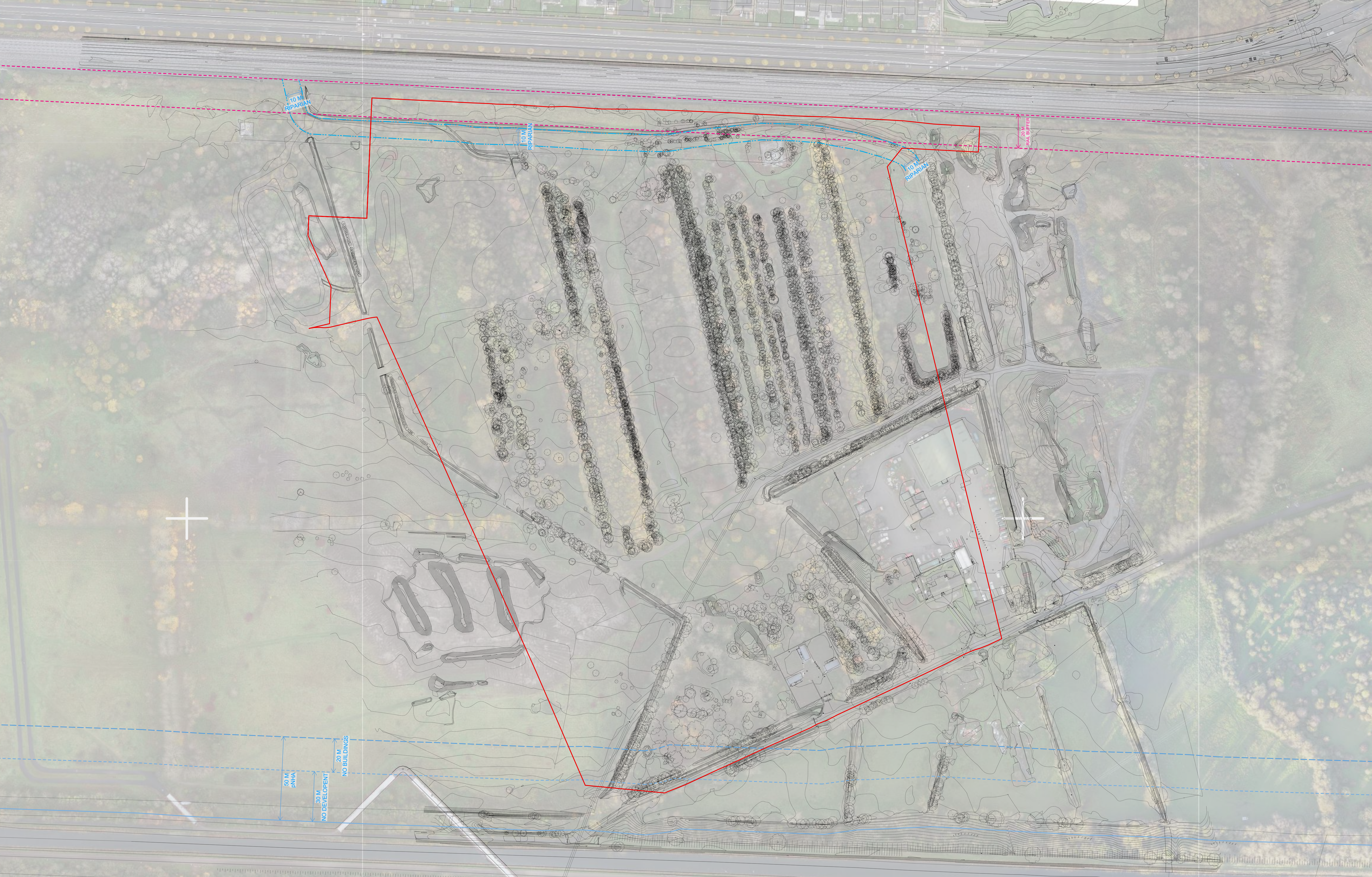
EXISTING SITE SURVEY OVERLAY ON AERIAL MAP 1:1000 @ A1

GENERAL NOTES: DRAWING TO BE READ WITH REFERENCE TO THE FOLLOWING ASSOCIATED DRAWINGS AND INFORMATION: - 0000 SERIES DRAWINGS: EXISTING SITE INFO. - 4000 SERIES DRAWINGS: GA DRAWINGS/ UNIT TYPES INFO. - 1000 SERIES DRAWINGS: PROPOSED SITE LAYOUT INFO. - 5000 SERIES DRAWINGS: PROPOSED MATERIALITY - 2000 SERIES DRAWINGS: PROPOSED ELEVATIONS INFO. - 6000 SERIES DRAWINGS: HQA AND ASSOCIATED SCHEDULE OF INFO - 3000 SERIES DRAWINGS: PROPOSED SITE LONGITUDINAL SECTIONS - ARCHITECTURAL DESIGN STATEMENT